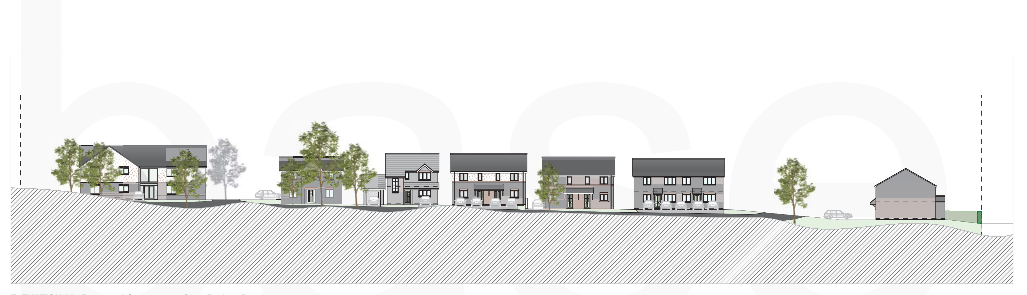
ELEVATION 01 - Proposed Street scene from Ruthan Road